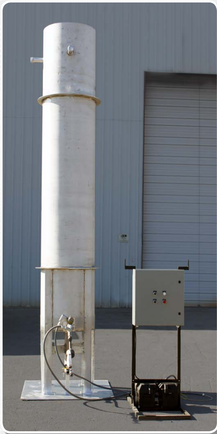
Enclosed Flame Wellhead Flare System