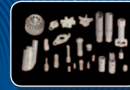
PARTS & SERVICE

COMBUSTION AND ENVIRONMENTAL SOLUTIONS. PURE AND SIMPLE.®