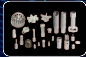
PARTS & SERVICE