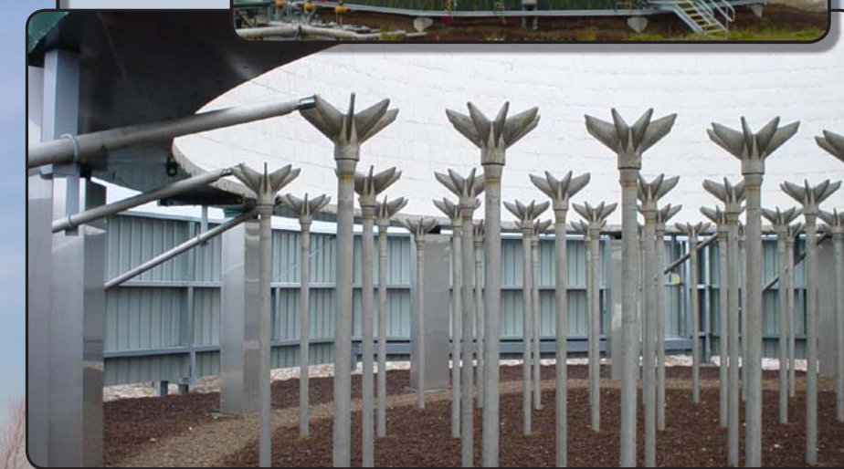
Enclosed Ground Flare with Interior Chamber Cast Burner Heads