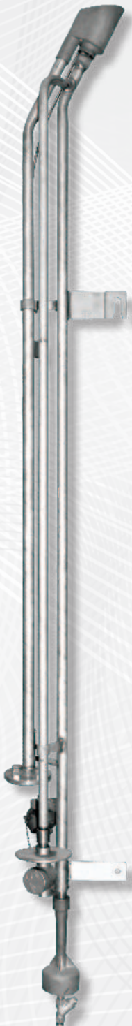
HSLF Flare Pilot

Zeeco leads today's global market in the design of combustion equipment. ZEECO flare systems have been operating around the globe for more than 30 years. Our philosophy of providing customers with superior quality, on-time shipments and competitive pricing is the cornerstone of our success. Every customer request is promptly addressed by Zeeco's combustion engineers. You can trust us to put our experience to work for you. Call or email us today to learn more about the full line of ZEECO flare products and replacement components for your new or existing flare system.