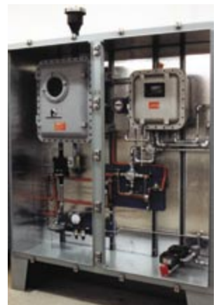
Temperature Controlled Free Standing Enclosure