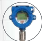
Freedom 6000 Transmitter

When local display is required, the Freedom Direct detector can be upgraded seamlessly to the Freedom 6000 transmitter in the field, providing customers the functionality that they desire.